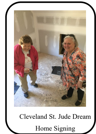
Cleveland St. Jude Dream Home Signing

We have all received our vaccines but continue to “be safe” as we enjoy a little more social activity, including eating out and visiting quilt shops.