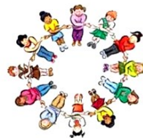
EMBRACE THE SPIRIT OF ESA