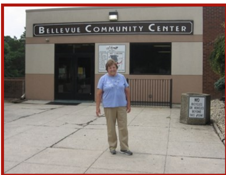
ESA Ohio's supply donation to the Easter Seals' Camp.