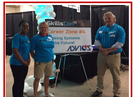
EASTER SEALS SKILLSCON '17 CAREER EVENT