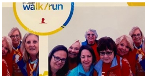
ESA St. Jude Walk volunteers downtown in photo booth