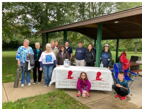
Team Sigma Chi - St. Jude walk at Seven Gables Park

participating at St. Jude Walks in Cincinnati, Cleveland, and Columbus raised $6,430. O-H-I-O is mighty in many ways!