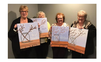
Easterseals GC - 2019 Feb. "Opening Minds Through Art Painting Party" Fundraiser— Gamma Kappa artists